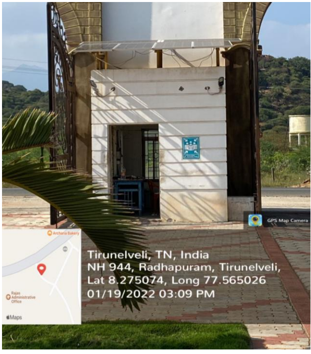
Weblink for Solar Power:

\frac{\text{http://rajasdentalcollege.edu.in/assets/images/facility/solarpaneldripirrigation/IMG\_9696.jpg}{\text{http://rajasdentalcollege.edu.in/assets/images/facility/solarpaneldripirrigation/4.1.3%20Solar%20panel} \\ \underline{\text{s\%20(2).JPG}}